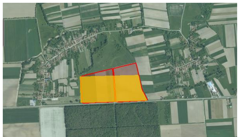
K.O. Vraneševci, kč.br. 607/15 approx. 670m x 250m