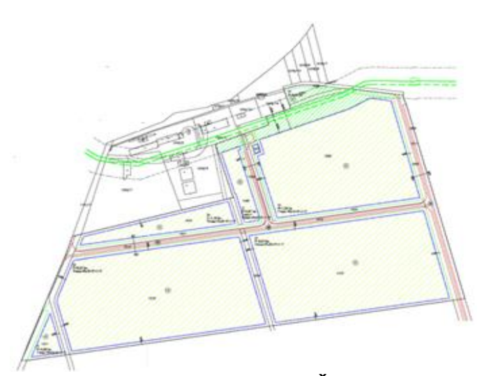
Layout of the Ind.Zone Čađavica

Note: Production and processing of meat per Halal- and Kosher-procedure